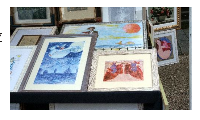
4) Arti e Mestieri, the last weekend of each month in piazza San Giusto. In this exhibition and market, local potters, painters, sculptors, and those who work with leather, glass, fabrics, and metals display their creations.