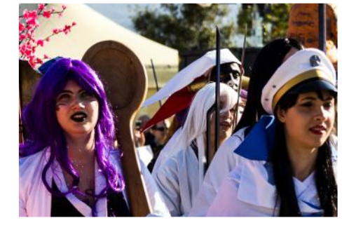
9) Lucca Comics and Games, an international fair at the end of October/beginning of November, features markets, games, and exhibitions throughout town, with lots of people old and young from all over Europe dressed in wonderful costumes.