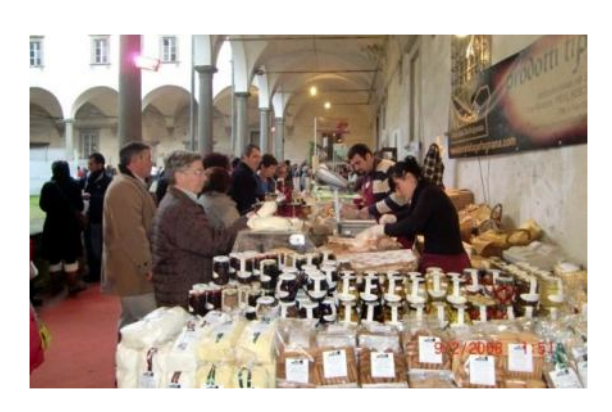
10) Il Desco: Sapori e Saperi Lucchesi , a market dedicated to Lucca and its local products, takes place during the last days of November and the beginning of December.