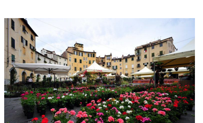
6) Fiera di Santa Zita. During the same period (27 of April) as the commemoration of Saint Zita (the patroness of housekeepers, bakers, and Lucca itself) this exhibition-market takes place in Piazza dell' Anfiteatro. Exhibitors from all over Tuscany show their amazing flowers and ornamental plants.