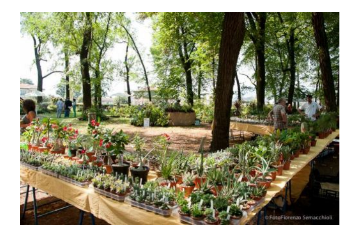
7) Murabilia , an exhibition market about gardening, takes place during the first weekend of September on the walls of Lucca, at Baluardo San Regolo and Baluardo la Libertà. This is one of the most important Italian exhibitions dedicated to plants, flowers and gardening.