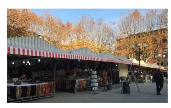
11) Mercatino di Natale Starting at the end of November and continuing until January, Piazza Napoleone hosts the holiday markets. This isn't very different from any other mercatino. But usually there are charity stands and we all know that generosity makes you a happier person!