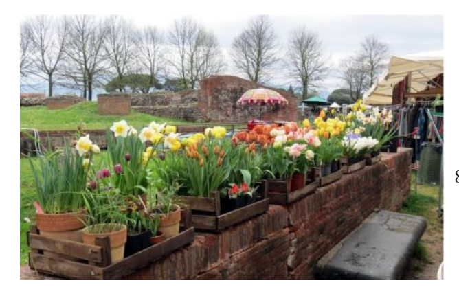
8) Mercatino del Settembre Lucchese . 13 September is the most important date of the year for the citizenry of Lucca, when the sacred procession of the Volto Santo takes place. At this time is the Mercatino in Piazza Napoleone (and also in Borgo Giannotti), which lasts for a week.